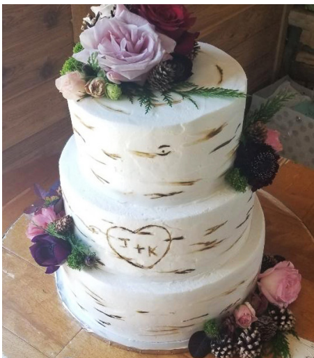
Style 7 - *Design Upgrade