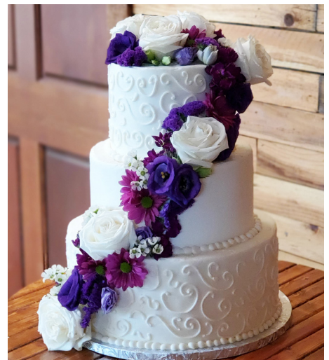
Style 9 - *Design Upgrade