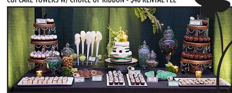
MIX & MATCH TIERS AND GLASS PIECES - $50 RENTAL FEE