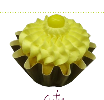
{3-Bite Size} Recommended Quantity: Recommended Quantity: 1.5 per person