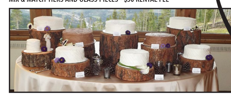
RUSTIC WOOD LOGS IN VARIOUS SIZES/HEIGHTS - $50 RENTAL FEE