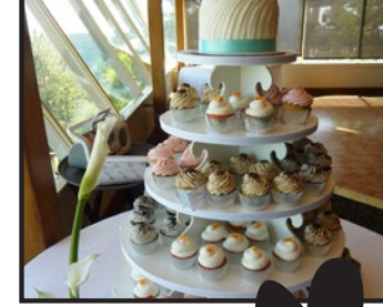
CUPCAKE TOWERS W/ CHOICE OF RIBBON - $40 RENTAL FEE