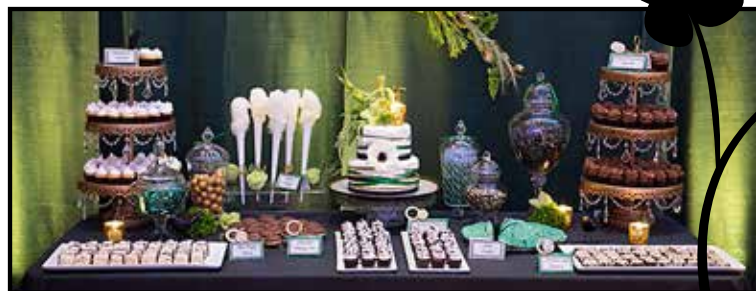
MIX & MATCH TIERS AND GLASS PIECES - $50 RENTAL FEE