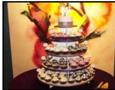
CUPCAKE TOWERS W/ CHOICE OF RIBBON - $40 RENTAL FEE