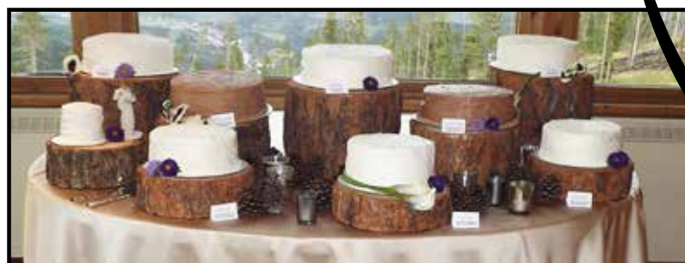
RUSTIC WOOD LOGS IN VARIOUS SIZES/HEIGHTS - $40 RENTAL FEE